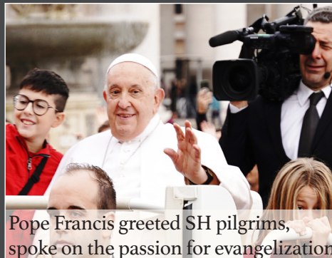
Pope Francis greeted SH pilgrims, spoke on the passion for evangelization, reconciliation, unity and peace and blessed their religious articles