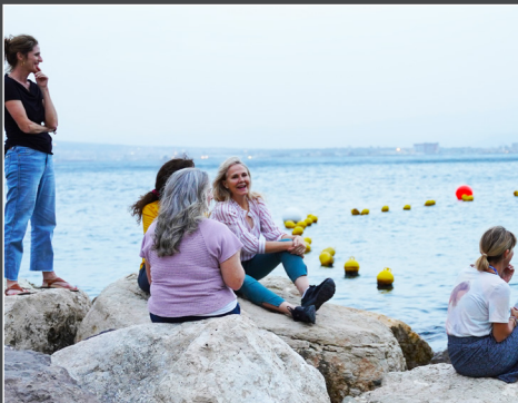
Swimming in the Bay of Naples, an arm of the Mediterranean Sea