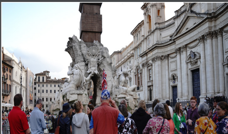
Group at the Obelisk of Piazza Navona at the Church of Saint Agnes in Agony

What a gift it was, not only to walk the same streets as the Saints, but also to get to know their stories and to be encouraged on this pilgrimage of life towards our Heavenly destination. All thanks be to God for a safe return!