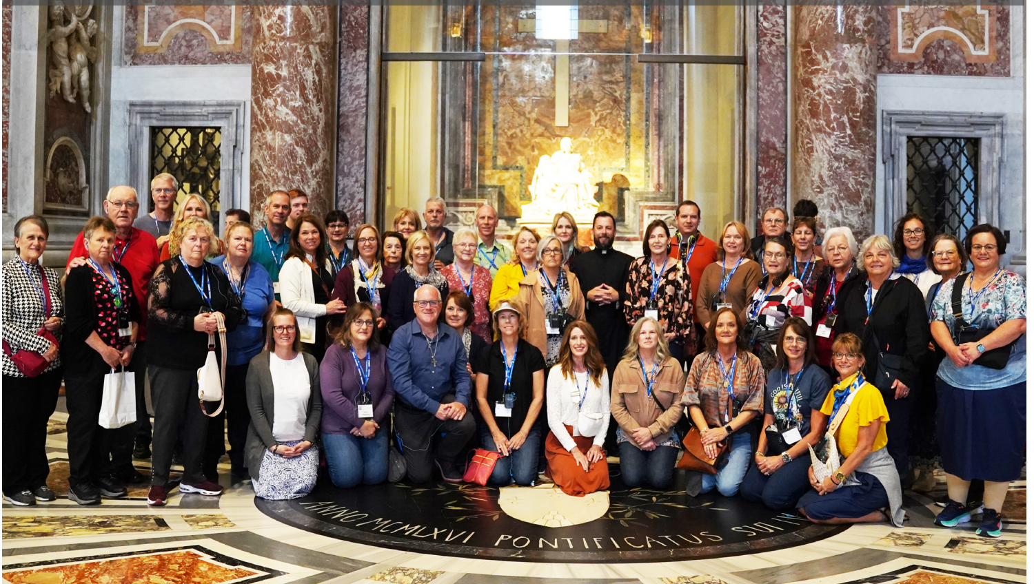
Sacred Heart Pilgrims in front of the Pieta by Michelangelo in Saint Peter’s Basilica at the Vatican in Rome