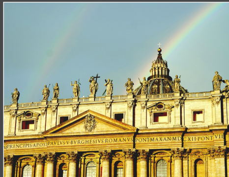
Double rainbow over Saint Peter's Basilica at the Papal General Audience