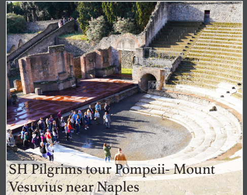
SH Pilgrims tour Pompeii- Mount Vesuvius near Naples