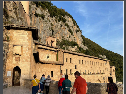
Group at Sacred Cave of Saint Benedict at Subiaco