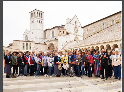
SH Pilgrimage group outside the Basilica of Saint Francis of Assisi